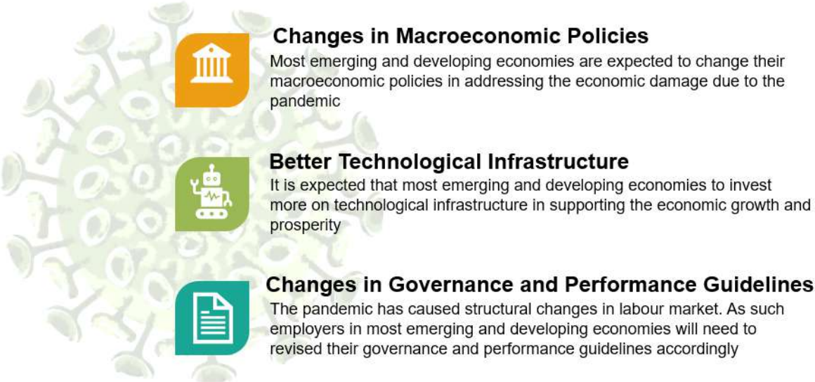
Figure 4: The Economic Expectation Post-Pandemic Period

credit to households and firms to restore international confidence. These economies need to diversify their economy and pursue trade policies that promote diverse exports, infrastructure investment to enable private sector competition, effective regulation to avoid market concentration, and support for innovation through research and development and embrace technological developments to stay competitive (Ruch 2019).