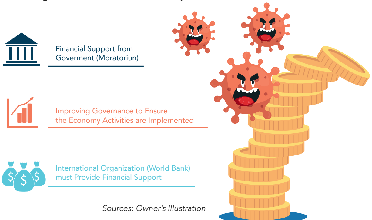
Figure 3: Possible Measures to Cope with the Pandemic

With the current shut down on economic activities initiated by the physical mitigation measures, policymakers have implemented relief programs of an unprecedented scale that focus on support for health care systems, expanded social benefit programs, and measures to help firms and households. Developing countries like Malaysia provide